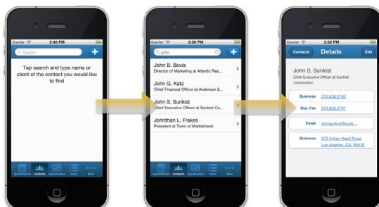
Figure 1: Search for clients and contacts easily.